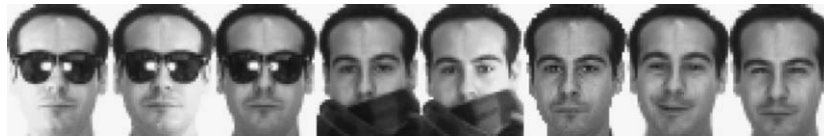
Fig. 2. Some face images generated from the AR database by using the down-sampling method in [19].