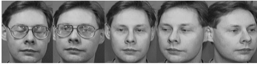
Fig. 1. Some face images from the ORL database.

The entries of W represent the similarity of the means of two classes and are determined as follows: W_{ij} = \exp(-\|F_i - F_j\|^2/t) , where F_i is the sample mean of the i th class, i.e. F_i = 1/n_c \sum_{k=1}^{n_c} X_k^i .